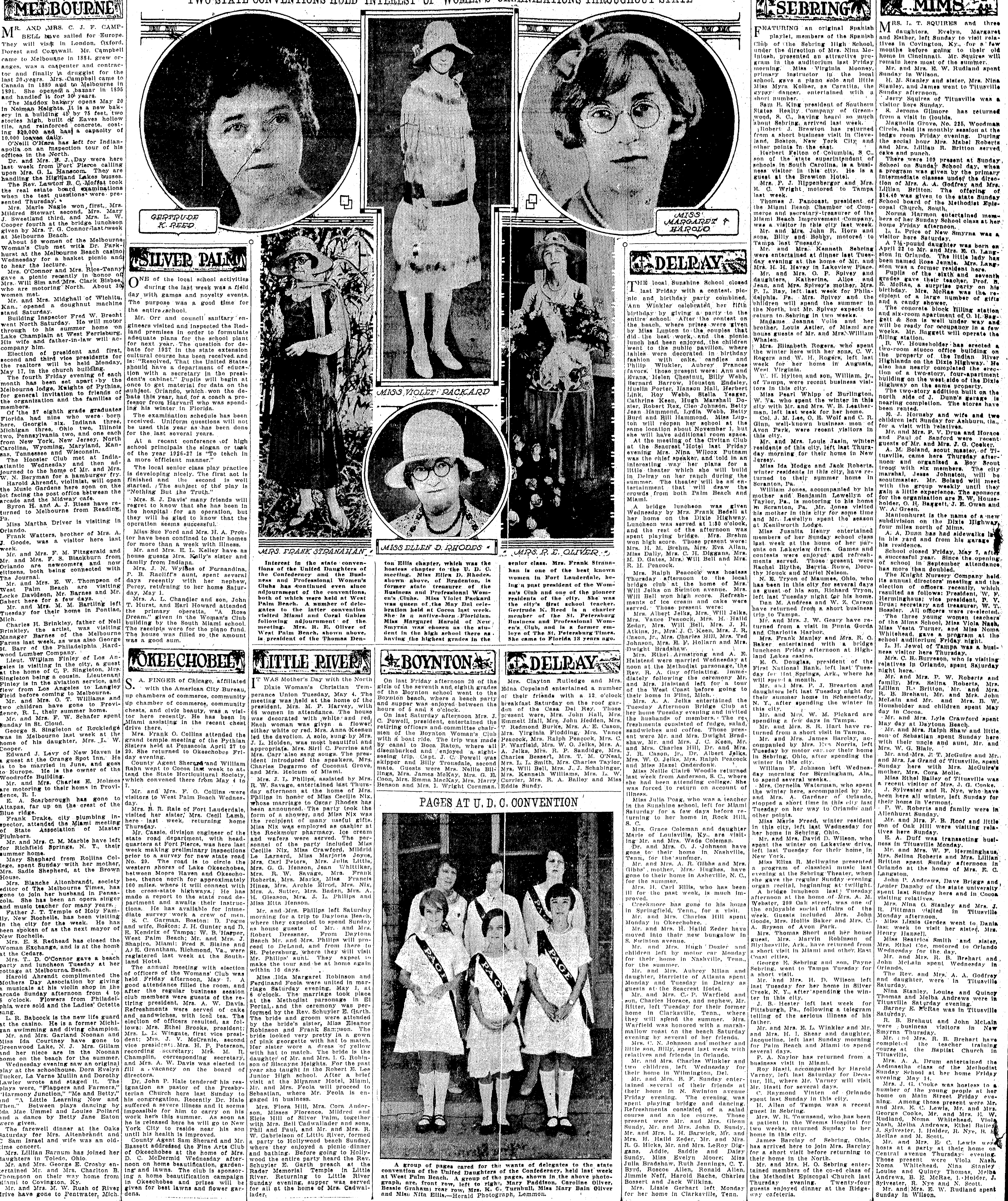
PAGES AT U. D. C. CONVENTION